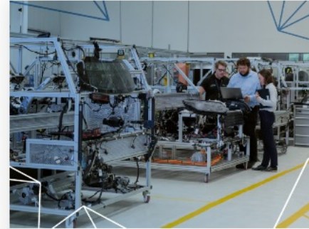
INNOVATIVE MANUFACTURING WORKING GROUP