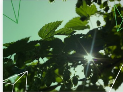
INNOVATIVE ZERO CARBON WORKING GROUP