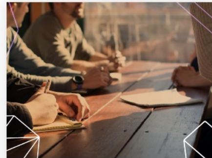
INNOVATION SUPPORT FORUM