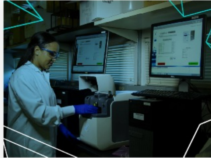
INNOVATIVE HEALTH WORKING GROUP