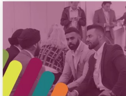
VENTUREFEST WEST MIDLANDS