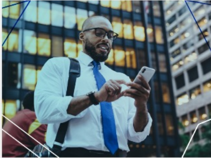
AI & FUTURE TECH FORUM