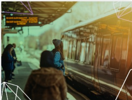
INNOVATIVE TRANSPORT WORKING GROUP